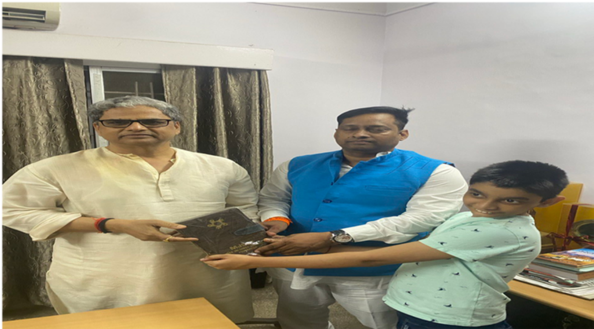
Maa Jai Shree Jagannath Foundation, Briefed about Initiative and Activities done by Trust (MJJF) to Respected Ex DGP & Chairman BPSC, Bihar.