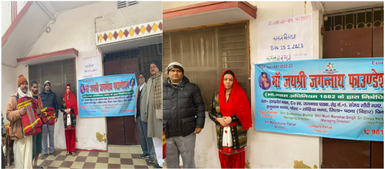
Blanket Distribution among the Poor People during Winter Season